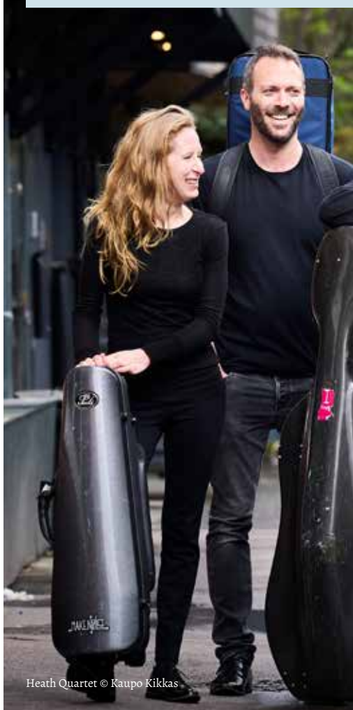
Heath Quartet