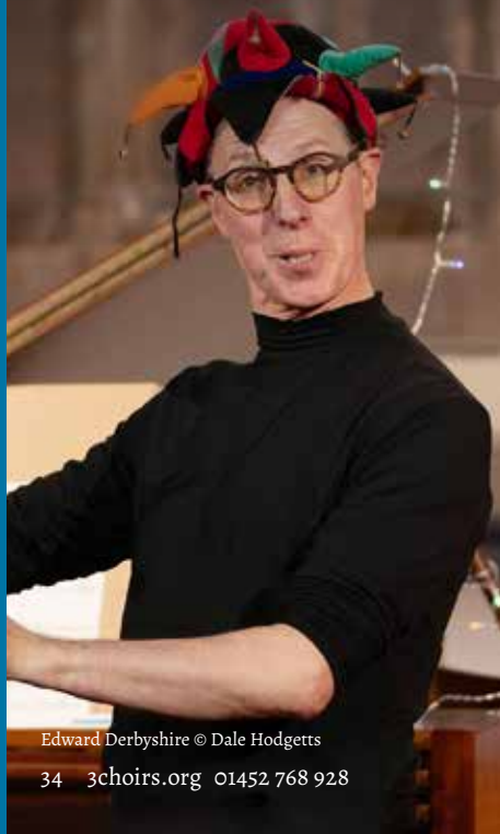
Edward Derbyshire © Dale Hodgetts