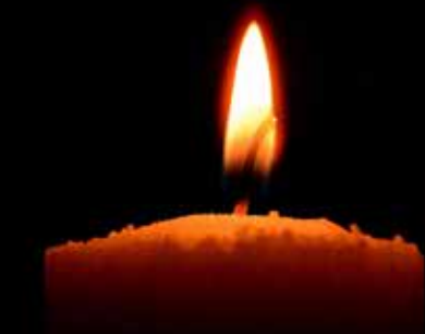
Candle