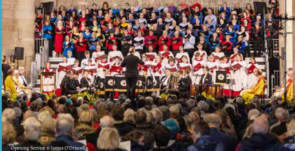
Opening Service